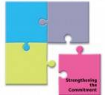
Modernising Learning Disability Nursing